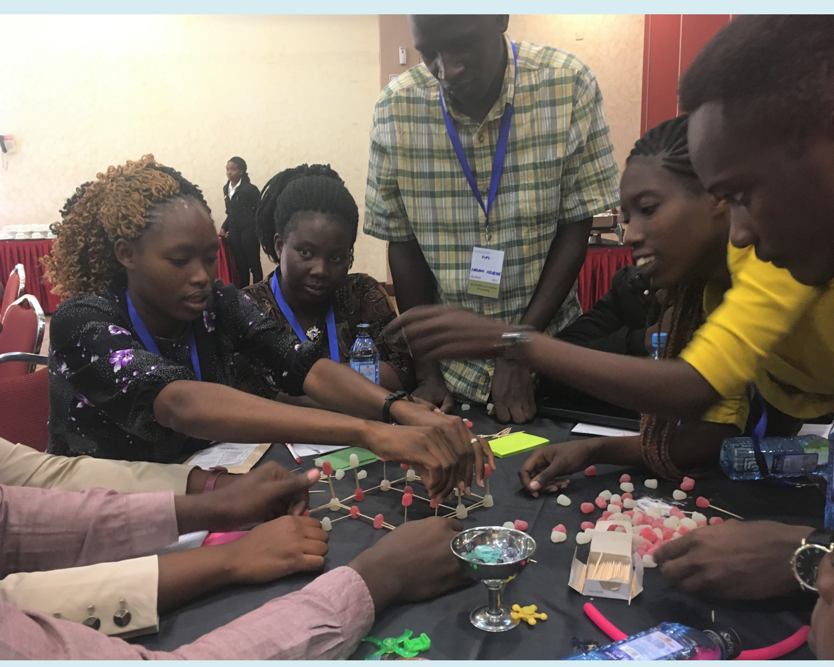
Making Cents International